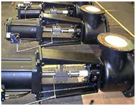
CERAMIC LINED VALVES

Fabricated spools with high chrome iron liners.